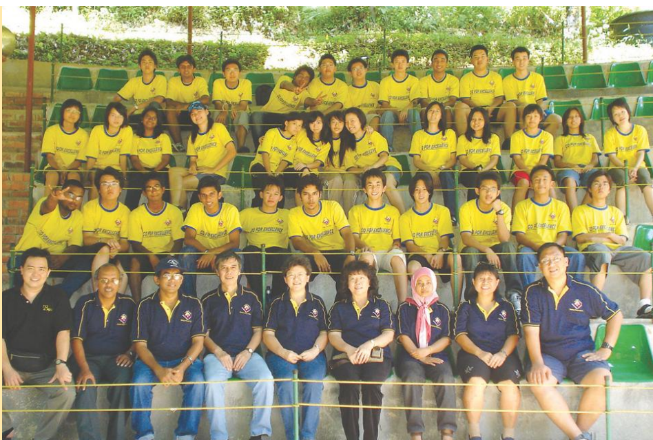
• Staff and new students at SUFES Campsite.