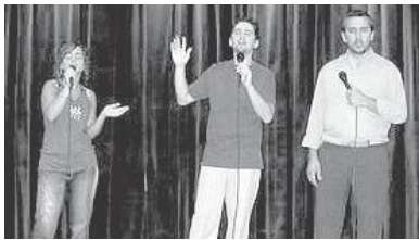
• CLAI Assembly opened in a Buenos Aires Pentecostal church.

The Office Administrator, Trinity Annual Conference, 2, Jalan 5/39, 46000 Petaling Jaya, Selangor Darul Ehsan. ✉