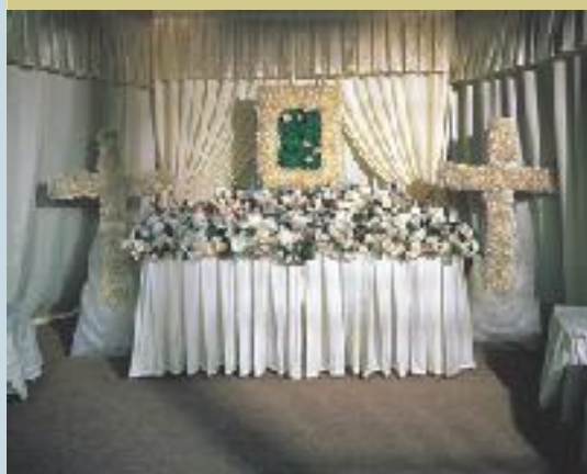
One-Stop Bereavement Arrangements & Services

One of Malaysia's most beautiful memorial parks, Nilai Memorial Park is situated just 30 minutes away from Kuala Lumpur. Surrounded by lush natural greenery, the Park successfully combines the best of oriental traditions and architecture with western planning and design. Set amidst all this is a series of tastefully designed and crafted memorials and niche columbariums, which not only provide a serene final resting place for our departed loved ones but also for others to pay their respects.