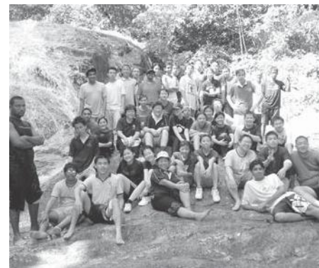
• Spectacular waterfall at the end of the stream trotting trail.