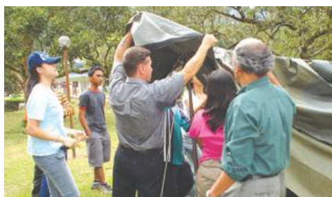
• Pitching Tents: Which is the right side up?