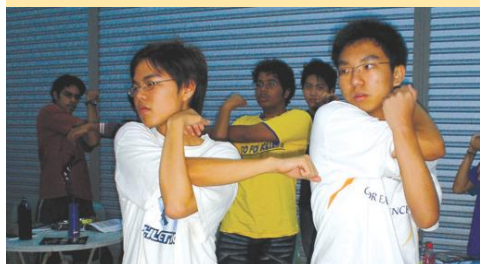
• Practical session at the 'No Apologies' workshop.