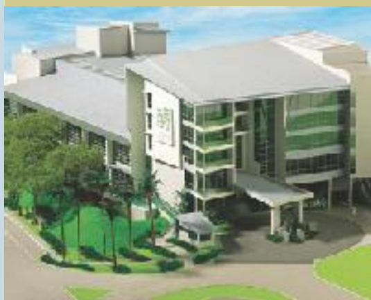
Xiao En Centre, Jalan Kuari, Cheras New addition to Xiao En Group (Estimated Date of Completion, Mid 2007)

There is peace of mind in being able to fulfill your final act of filial piety and assurance knowing that every detail will be taken care of conscientiously. There is dignity in a meaningful ritual well planned and well performed. A Xiao En Bereavement Care Package ensures that the warm memories of your departed loved one will endure for generations to come.