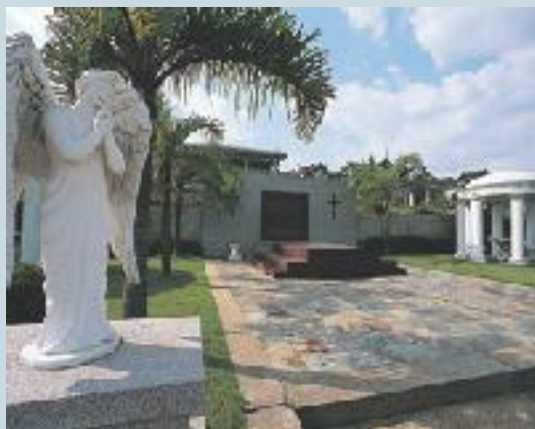
Specially Designed Burial Plots