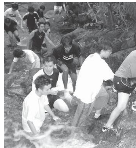
• Stream Trotting: Students hiking upriver.