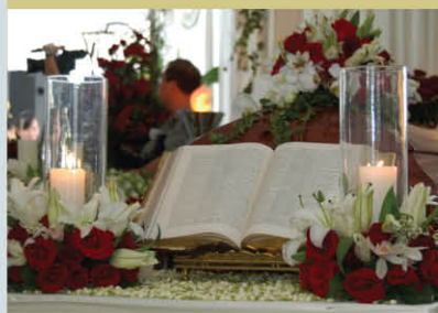
Professional Arrangements 专业策划

One of Malaysia's most beautiful memorial park, Nilai Memorial Park is situated just 30 minutes away from Kuala Lumpur. Surrounded by lush natural greenery, the Park successfully combines the best of oriental traditions and architecture with western planning and design. Set amidst all this is a series of tastefully designed and crafted memorials and niche columbariums, which not only provide a serene final resting place for our departed loved ones but also for others to pay their respects.