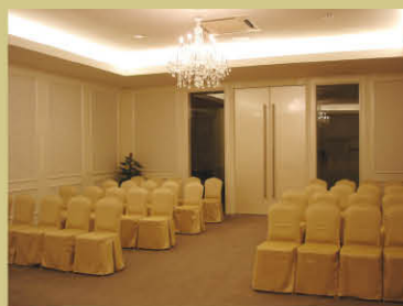
Multi Function Halls 多元用途礼堂