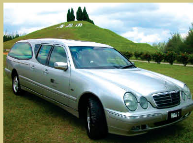
Imported Luxury Hearse 进口豪华灵车