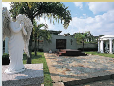
Special Design Burial Plot 特别设计墓地