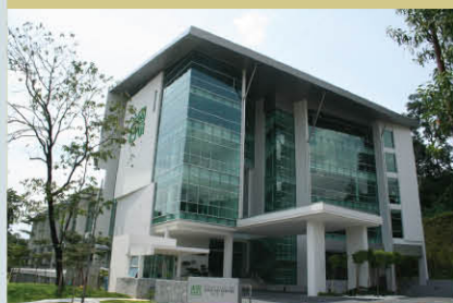
Xiao En Centre, Jalan Kuari, Cheras 孝恩館，吉隆坡蕉賴

There is peace of mind in being able to fulfill your final act of filial piety and assurance knowing that every detail will be taken care of conscientiously. There is dignity in a meaningful ritual well planned and well performed. A Xiao En Bereavement Care Package ensures that the warm memories of your departed loved one will endure for generations to come.