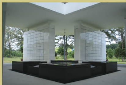
Open-Air Columbarium 开放式骨灰阁