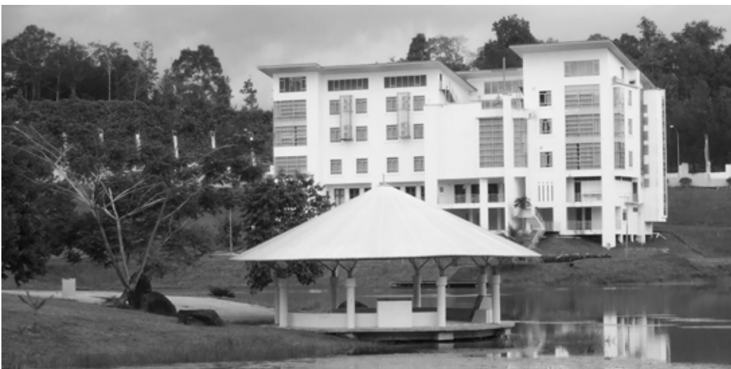
Lake side view of SCAC Centennial Park (百周年纪念园)

Contact person: Mr. Ngu Heng Kong 016-8610655