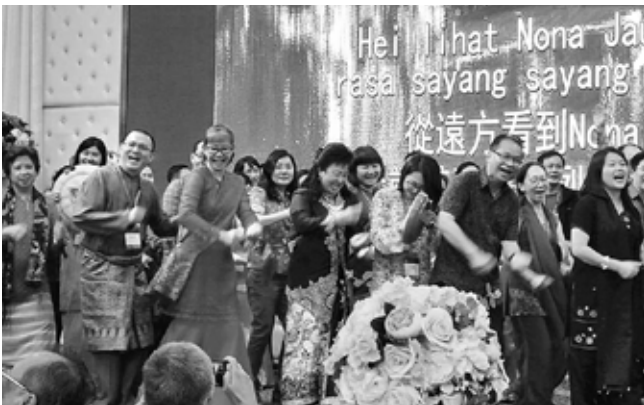
四、在大会第二晚的“欢迎晚宴与文化之夜”，吾会代表们换上民族服装，兴奋地载歌载舞，带出“Rasa Sayang”和“Lengang Kangkung”愉快的节奏。