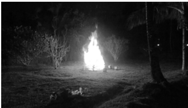
Camp fire (营火会)