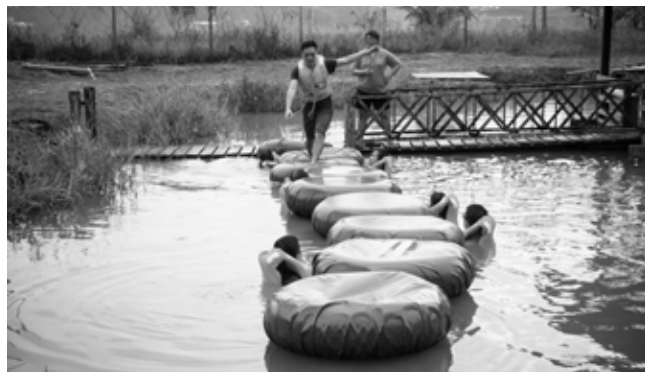
starlight pontoon (星光浮道)