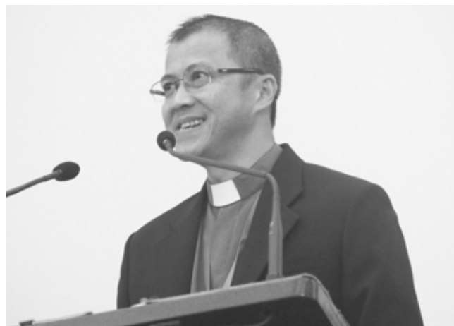
六、吾会的万富奇教区长担任华宣大会“查经三”的讲员