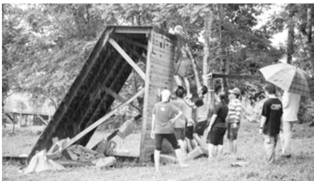
10' Wall (10尺墙)