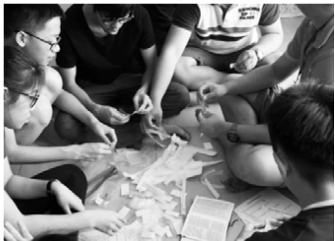
Group discussion and bible study is part of Trinity Youth’s programme

In youth, you might think that we play games every week. But no, we don’t. We also have bible studies, at least twice a month. At this point, I want to say thank you to all the advisors for really, really taking good care of us, not only physically but also spiritually. I am also saying this to assure the parents out there, that your children are safe with us in Trinity Youth.