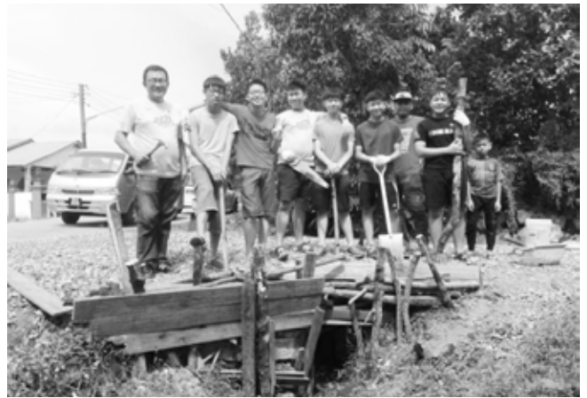
We also learn to serve in the community works like repairing the roads and building houses for the unfortunate.

God did not give us talents for nothing but He gave us talents to serve him and to glorify Him. We as the Youth, we serve in different ministries. For example our ushering team as well as our worship team. In the youth, being able to help out in the different ministries of the church really makes us feel at home.