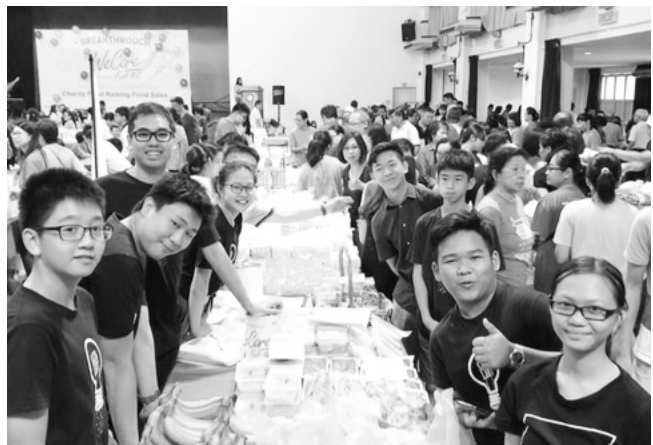
Enthusiastic, excited, energetic bunch... joining community programmes e.g. raising funds in Breakthrough ministry is also part of our activities

The youth are a bunch of enthusiastic, excited, energetic little adults. Sometimes, we might annoy you with our loud voices, non-stop chatter and shrieking laughs, but please bear with us until we grow out of it.