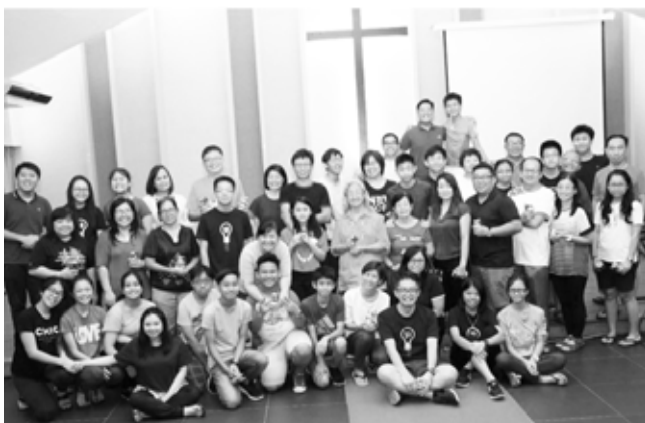
Thank you to our parents and advisors for being our biggest supporter

On the behalf of the Trinity Youth, we would like to thank our most wonderful parents for being our biggest supporter. It is a big deal for us. Thank you for taking time to send us to youth meetings and activities. It means a lot to us, because at the youth gatherings, we can meet our friends and have fun. For all you do, thank you.