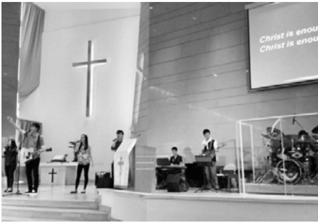
Using our talents in leading Praise and Worship in the Main Church