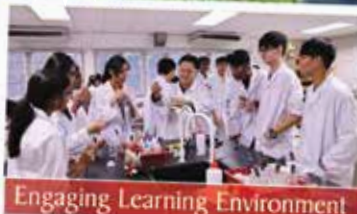
Engaging Learning Environment