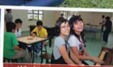
Wholesome Campus Life