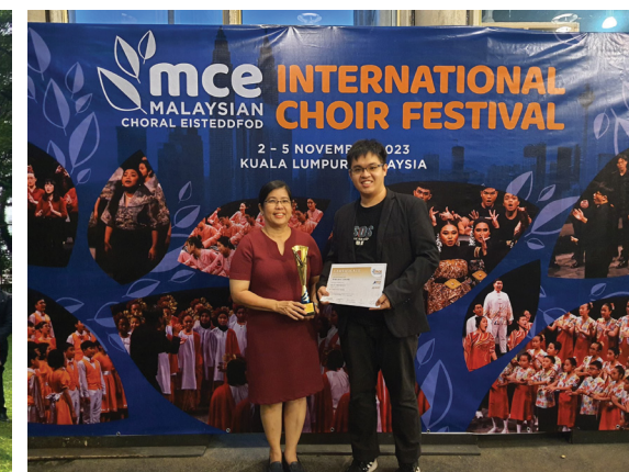
Certificate and trophy received by the school's Principal and Vice Principal - Academic at the event.

Students from Wesley Methodist School Bandar Seri Coalfields (Private) secured a bronze medal at the Malaysian Choral Eisteddfod International Choral Festival (MCEICF).