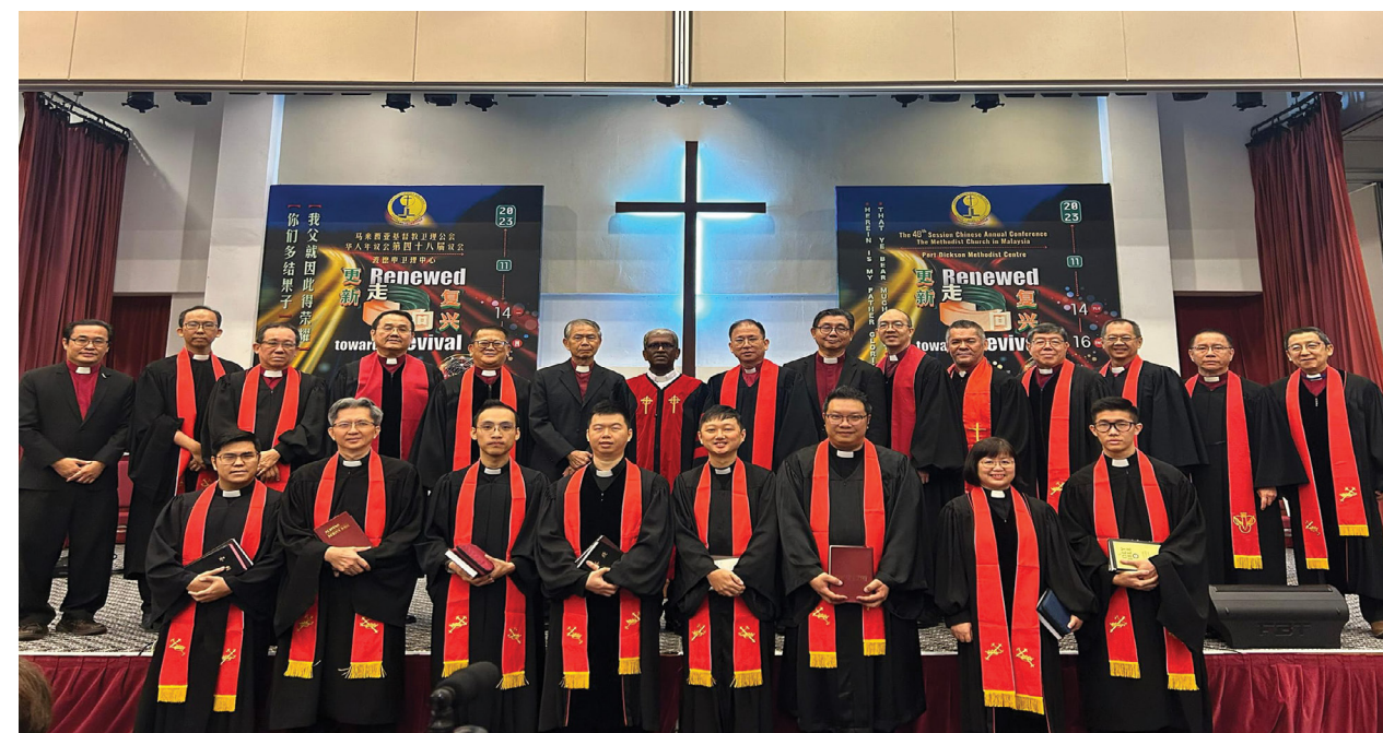
Newly ordained Pastors (被按立的长牧)