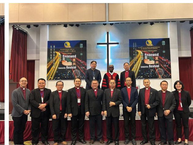
The ten District Superintendents (十位教区长)