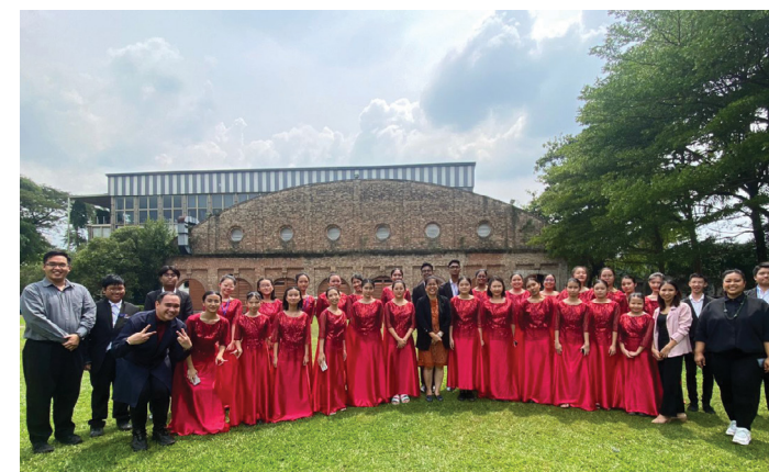
The group of students who won the bronze medal, together with their instructor, Vice Principal - Academic, and Principal of the school at MCE held at the KLPAC.