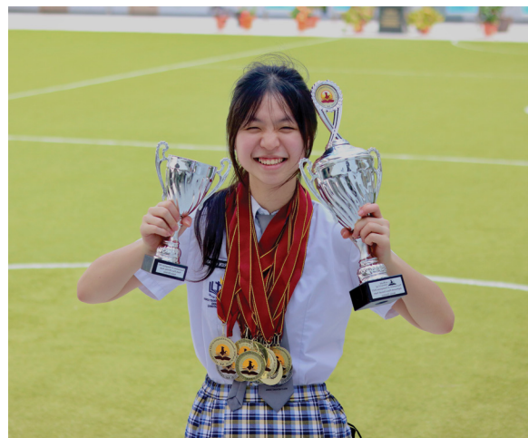
Happy face with medals around her neck and trophies in hand.

Students from Wesley Methodist School Penang (International) secondary school made their school and country proud by winning 22 gold medals, 42 silver medals, and 3 trophies at the recently concluded Tournament of Champions of the World Scholar's Cup (WSC) competition at Yale University, USA.