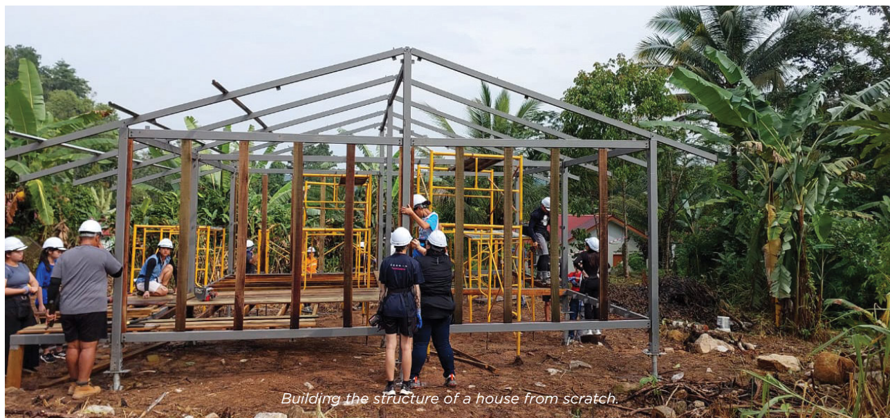
Building the structure of a house from scratch.

In October 2023, students at Wesley Methodist School Penang (International) (WMSPI) collaborated with Epic Homes to build a house for the Orang Asli in Kampung Songkok, Batang Kali, Selangor.