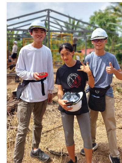
Students with happy faces while undergoing the construction- a meaningful experience for them.