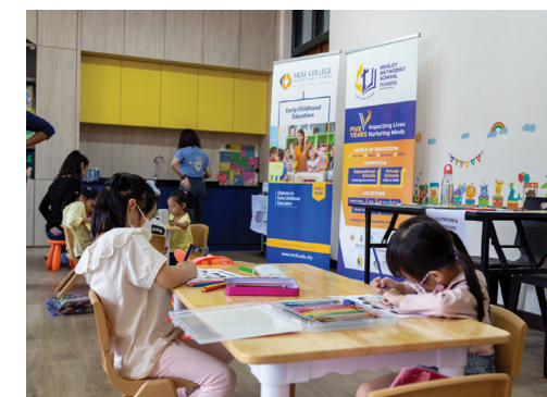
Early Childhood Simulation Room at MCKL College (Pykett, Penang Campus)

For further information on the programmes offered by MCKL, contact us at 03-2300 0998 (KL Campus), 03-23362164 (Pykett Campus, Penang) or visit www.mckl.edu.my to enquire more about our upcoming intakes. Follow MCKL on its official social media channels on Facebook, LinkedIn and Instagram @ MethodistCollegeKL.