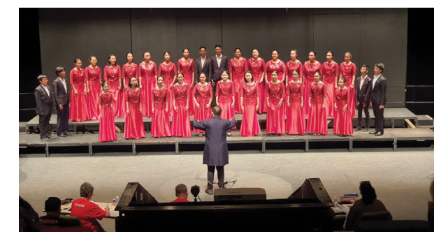
WMSBSCP student choir team performance

as one of Malaysia's largest and most prestigious choral festivals. It serves as a platform for singers, choirs, conductors and teachers to work with a distinguished team of international choral clinicians through our series of symposiums, competitions and festival concerts.