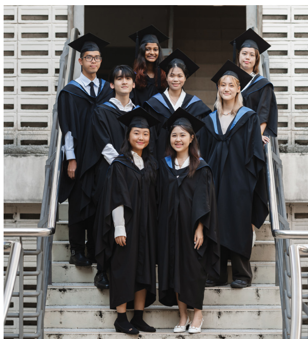
Some of the recent graduates from Diploma in Early Childhood Education, class of 2023.

MCKL and MTU, Ireland first entered a partnership with the ambition of enabling MCKL students to directly enter the final year of MTU's bachelor in early childhood education programme. MCKL's students are eligible for this express pathway due to the comprehensive selection of subjects and robust practical exposure. MCKL students are also entitled to a special discount and scholarships. Now boasting over 120 alumni, the partnership has grown from humble beginnings with just six students in the first year.