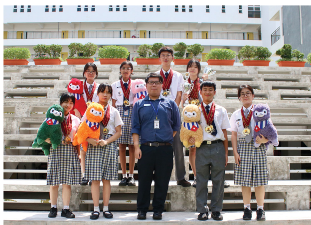
Students with their Vice Principal - Academic who accompanied them to Yale University during the competition.

great experience and exposure, our students have sharpened their essay writing skills, built courage to speak and debate, enhanced critical thinking skills, promoted the culture of reading and are ready for international competitions of higher levels.