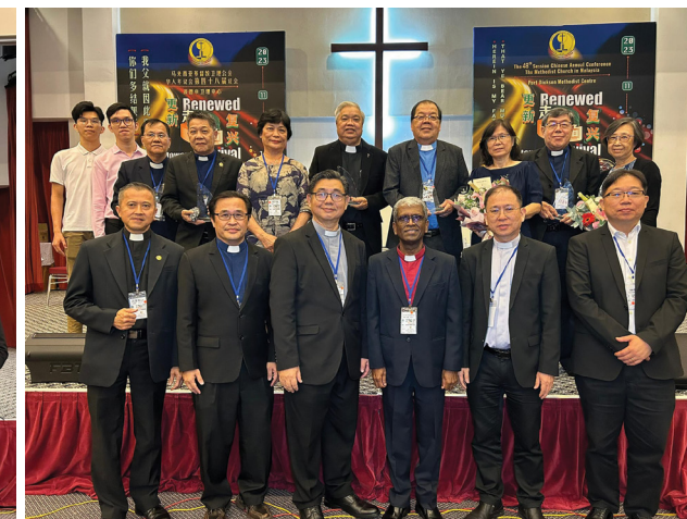
Retiring Elders (荣休的牧师)