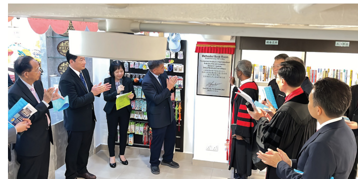
Unveiling the plaque

We praise God that MBR now has a branch outlet in Kota Kinabalu to serve our churches and the local community with Christian books, gifts and other resources.