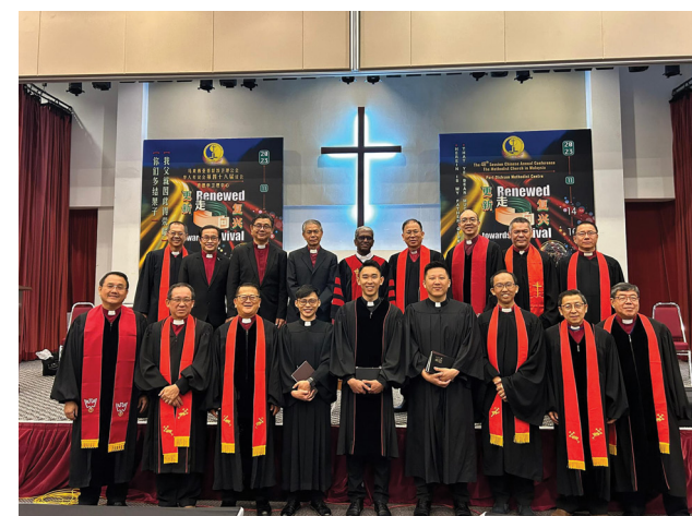
Newly ordained Vice-Pastors (被按立的副牧)