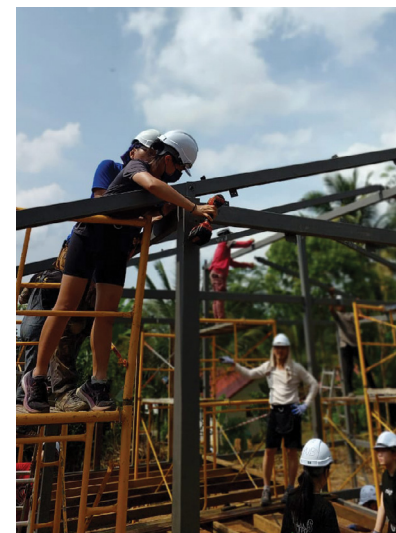
Building in progress: ensuring the foundation of the house is built properly.

The project cost over RM110,000. Through a fundraising event that aimed to help build homes for the Orang Asli family, students of WMSPI successfully raised the much-needed funds by selling cookies, nuts, ice-creams, drinks, accessories, and t-shirts designed by them, providing car wash service, receiving donations from parents, family members, friends, and some corporate sponsorships.