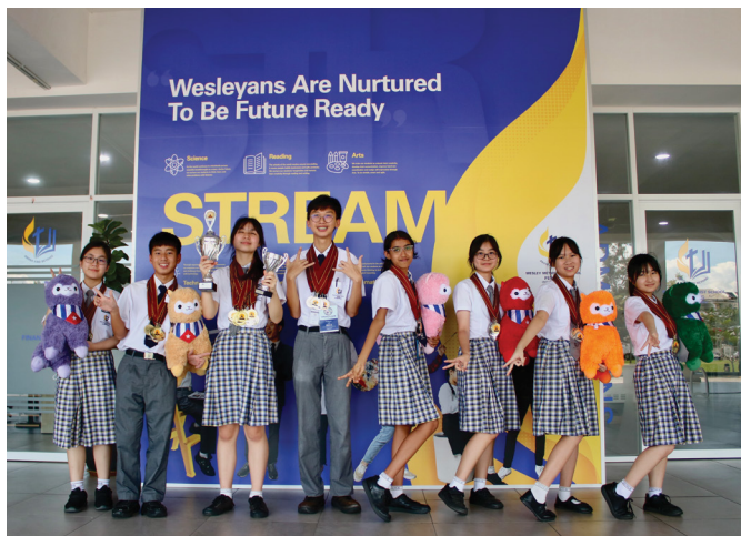
Participating students in the WSC Competition