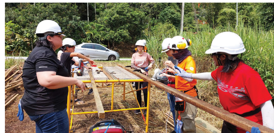
WMSPI Students in Action