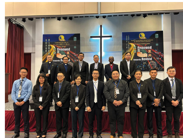
New Co-workers (新同工)