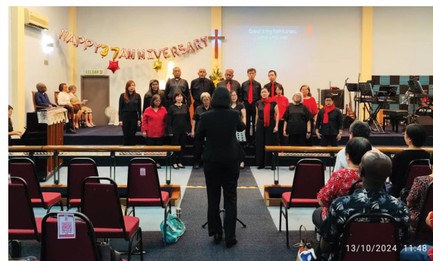
Performance by Grace Notes Choir

Throughout these many years of journey with our Lord, WMCK had experienced her own unique sets of ups and downs, problems and crises. In retrospect, we could see we had overcome all things through the mighty hand of God, covering and pushing us forward. We could see His steadfast faithfulness, in spite of our many shortcomings and failures. We are truly thankful for this opportunity to hold this anniversary service to mark His unconditional faithfulness. Experiencing God daily through our church life is indeed an invaluable privilege as we build our church around the five areas of worship, fellowship, discipleship, ministry and evangelism/mission. The last has always been our weakest so Bishop's message of 'Renewed Mission' was a timely reminder from God to our church. This should always be for us all the way forward.