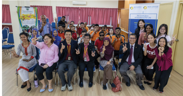
Beyond 20 student-volunteers

Beyond 20 is a student-led initiative at Methodist College Kuala Lumpur (MCKL) dedicated to fostering a culture of consistent and collaborative community service. Rooted in the college's mandatory Service-Learning class, it offers monthly volunteer opportunities in partnership with various NGOs.