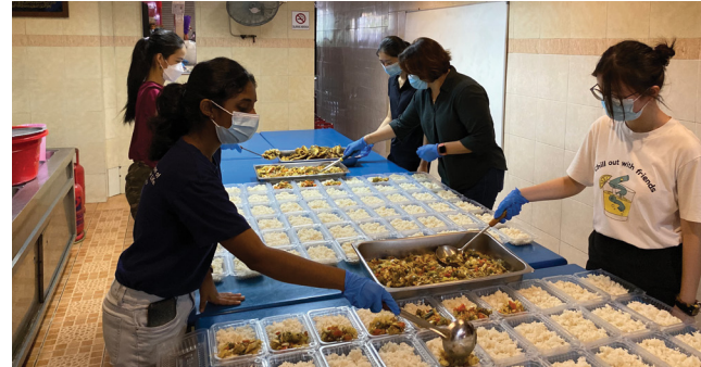
Beyond 20 team members volunteering at the Pertiwi Soup Kitchen

Notable projects included partnerships with Kebun-Kebun Bangsar, a community garden, and Friends of Sungai Klang, an environmental NGO. One of Beyond 20 's standout projects was Classroom Connections, a humanitarian initiative launched to support special needs children at the Selangor and Federal Territory for the Mentally Handicapped (SAMH) Wisma Harapan in Brickfields. A total of RM2,000 was raised and donated to the organisation along with educational materials collected.