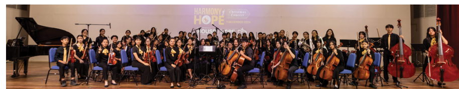
WMSPI Symphony Orchestra

At Wesley Methodist School Kuala Lumpur (International) , students came together during a special Christmas Chapel Service on 5 December 2024. This solemn occasion allowed the students to reflect on the significance of Christmas, deepening their understanding of faith, love, and gratitude. The service featured prayers, hymns, and a message of hope, ensuring that the true essence of the season is not forgotten amidst the festivities.