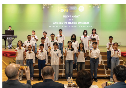
One of the student performances with handbells