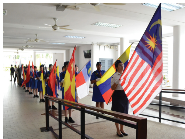
Procession by the Girls' Brigade bringing the flags of each Malaysian state