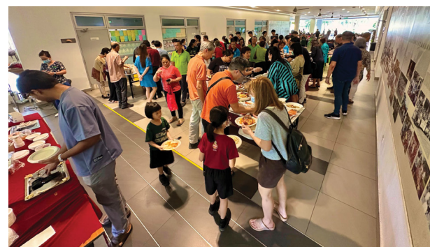
Many came to join the Pot Bless

The sweet voices of children from Haknook Jenang Hostel in Raub echoed throughout the Sanctuary as they performed two songs, "Segala Puji Syukur" and "Goodness of God," accompanied by tambourine and flag dance. The TMCPJ Sanctuary Choir also rendered a beautiful medley of songs praising and worshipping our Lord God Almighty.