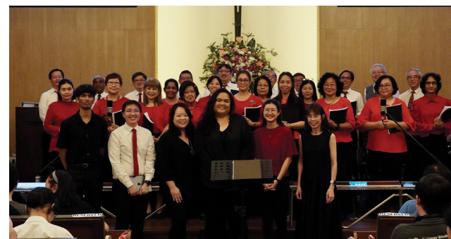
The melodious voices from the Cantata