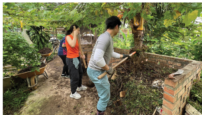
Beyond 20 members volunteering at Kebun-Kebun Bangsar

Under Chan's leadership, Beyond 20 has attracted over 50 student-volunteers and organised more than 13 volunteer sessions and several additional projects.