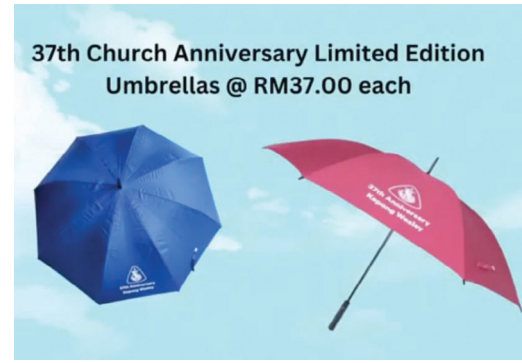
Anniversary souvenir sale

Grace and peace to all from Wesley Methodist Church Kepong.