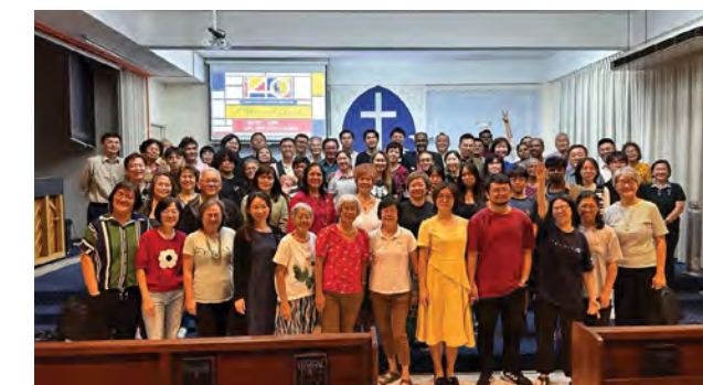
Wesley Methodist Church Kuantan - Total of 84 worshippers