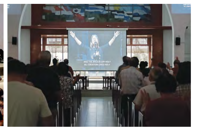
Wesley Methodist Church Melaka - Packed hall on Sunday afternoon