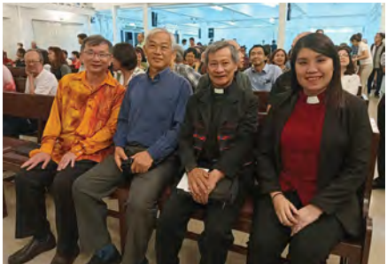
A section of the congregation