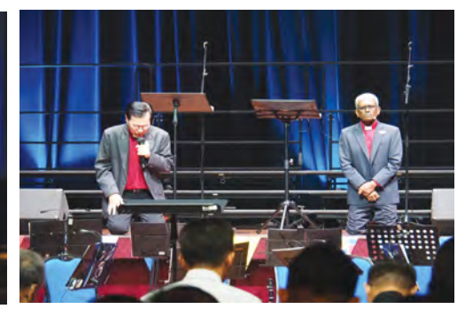
As Bishop knelt before the Lord, he requested the congregation to do likewise