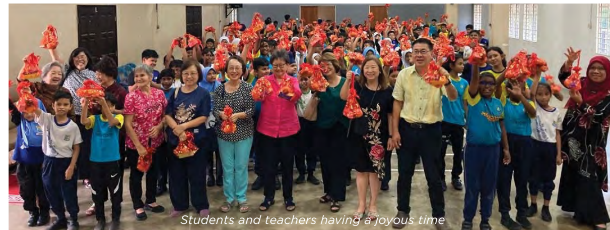
Students and teachers having a joyous time

On the morning of 14 January 2025, a dedicated group of Methodist Women (MW) members gathered at the Connect Lounge of TMCPJ, to prepare 400 gift packages filled with festive mandarin oranges, refreshing drinks, and delicious cookies for the pupils and staff of Methodist Primary School (MPS), situated opposite the church. This heart-warming tradition has been part of the Chinese New Year celebrations for several years, embodying the spirit of the 'One Church, One School' collaboration.