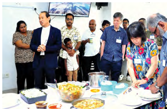
Wonderful Pot-bless lunch by church members/worshippers