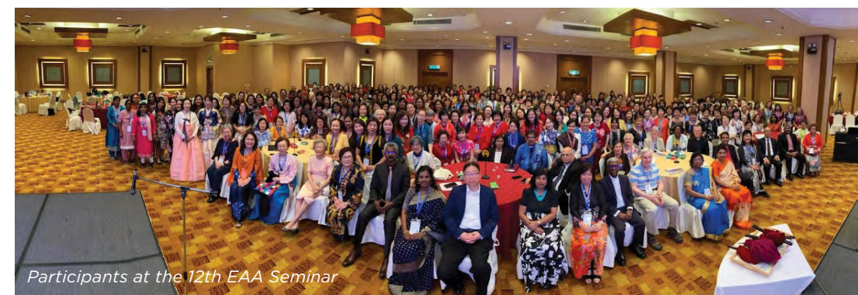
Participants at the 12th EAA Seminar

The World Federation of Methodist and Uniting Church Women has nine geographical areas in the world. The East Asia Area consist of Malaysia and 8 other countries namely, Korea, Taiwan, Singapore, Indonesia, Philippines, Hong Kong, Cambodia and Japan where the latter two countries are associate members.