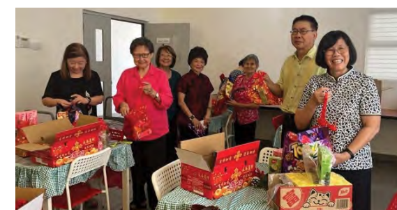
MW members preparing the gift packs.