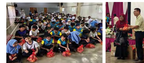
Students and teachers receiving the gifts.

Together, through initiatives like 'One Church, One School', we continue to build a stronger community, enrich lives, and share the joy of cultural celebrations.