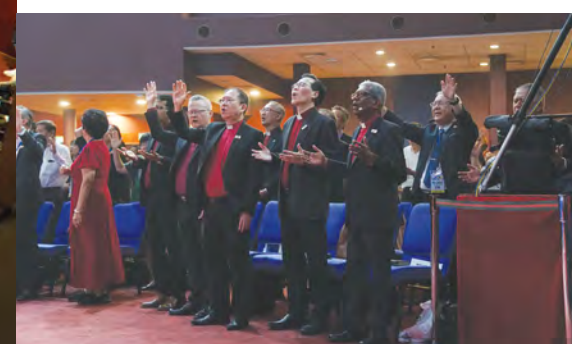
Bishop and Presidents from various Annual Conferences