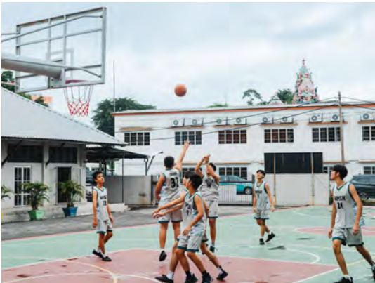
Students playing basketball as one of their extra-curricular activities

At WMS, we nurture each student's potential by focusing on their mind, body, and spirit. Our curriculum fosters a love for learning while encouraging personal development through a wide array of subjects, extracurricular activities, and growth-oriented programmes. This holistic approach ensures students gain confidence, resilience, and a strong sense of identity.