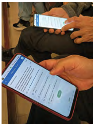
Methodist Trivia! A time to know more about Methodism in Malaysia!