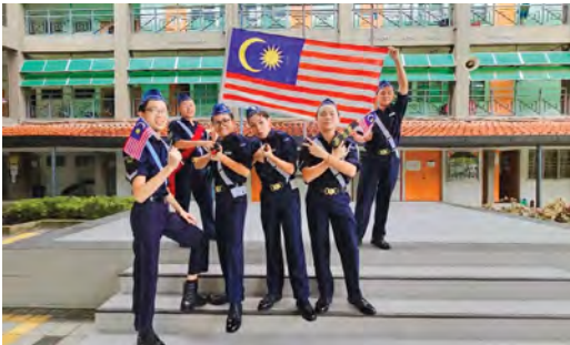
Girls' & Boys' Brigade