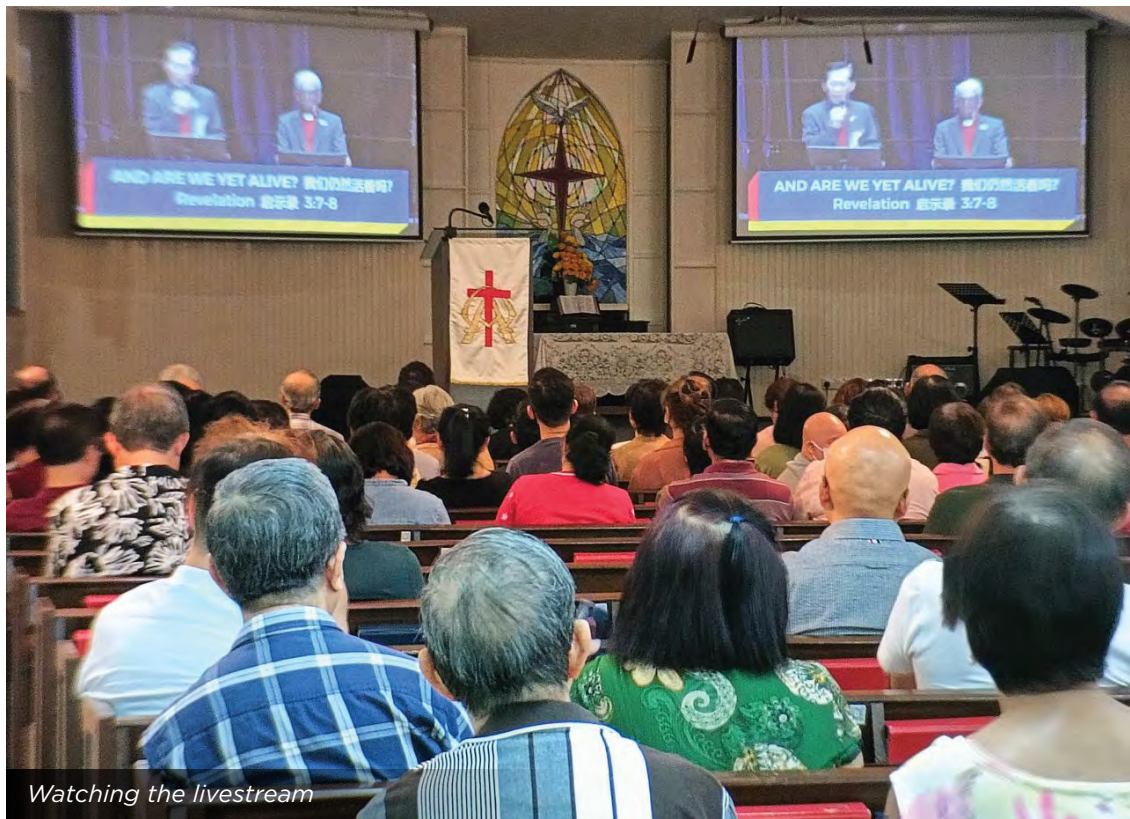
Watching the livestream

On March 2, 2025, more than 200 brothers and sisters, and pastors from the Methodist churches across the Northern District gathered at Trinity Methodist Church, Penang, for a special simultaneous worship session. The event was a time of worship and thanksgiving, commemorating the 140th anniversary of The Methodist Church in Malaysia.