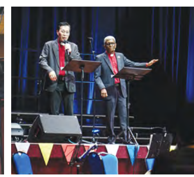
Bishop's sermon 'And are we yet alive?' was the title of a hymn from Charles Wesley