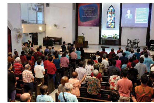
Wesley Methodist Church Ipoh - Standing for the responsive affirmation