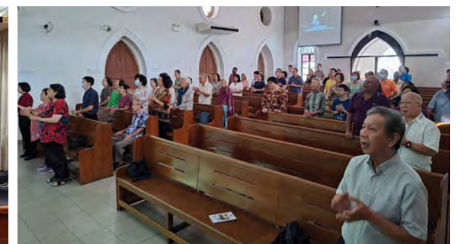
Wesley Methodist Church Seremban - United in one voice