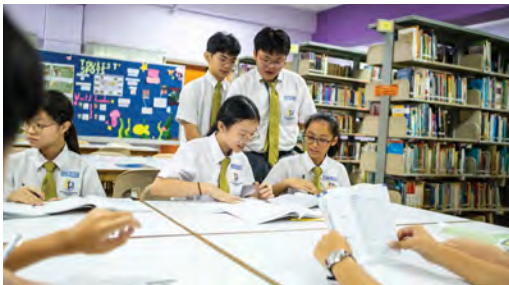
Students working on assignments in the library