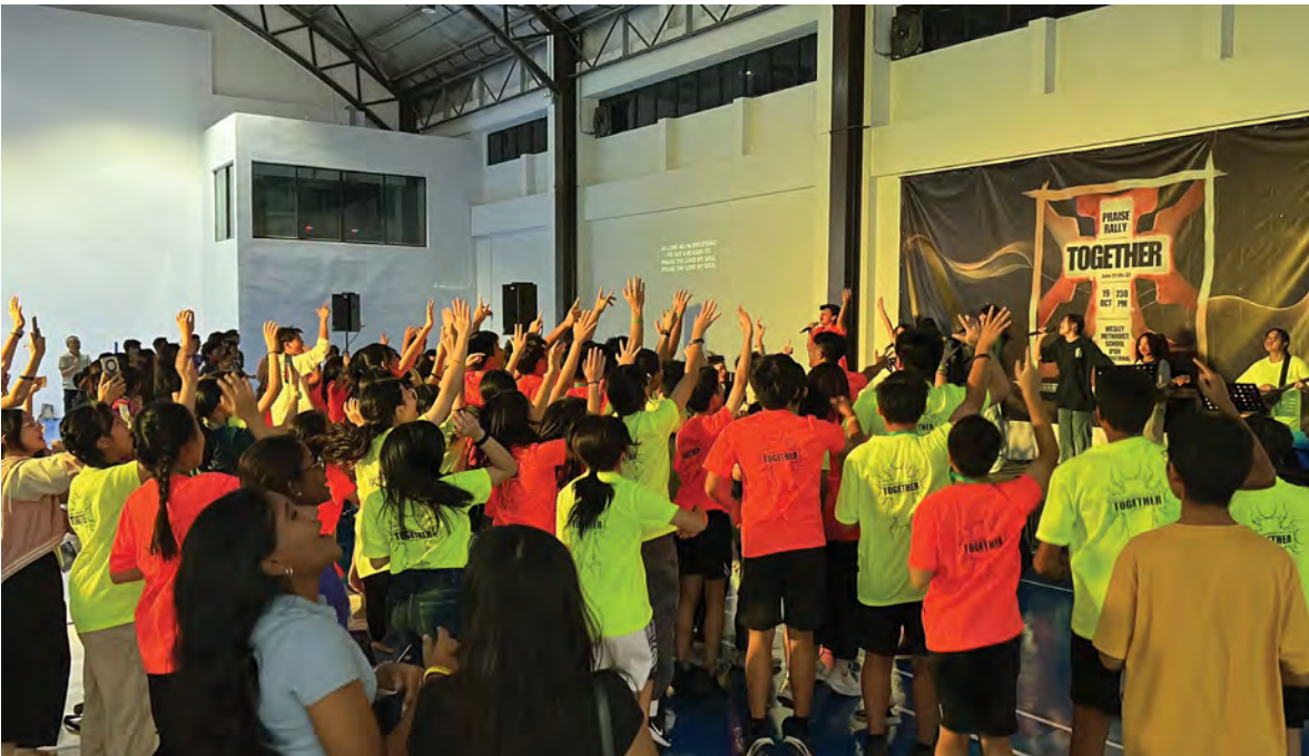
Students worshipping at Praise Rally

Choosing WMS means choosing an education that shapes well-rounded individuals ready to thrive in both personal and professional spheres. Our character-based approach equips students not only with the knowledge to pursue their dreams but also with the integrity and values to make a lasting positive impact on the world.