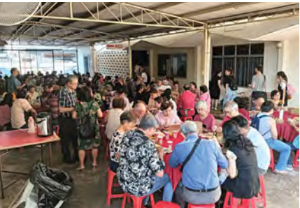
A time of fellowship over dinner