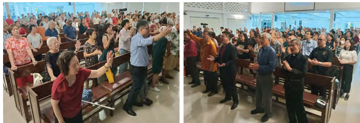
Praise and worship

Before the service, the attendees enjoyed pre-service activities, including photo sessions at specially designed 140 MCM booths, and a mini-quiz on the 140-year history of the Malaysian Methodist Church, adding excitement and engagement to the occasion.