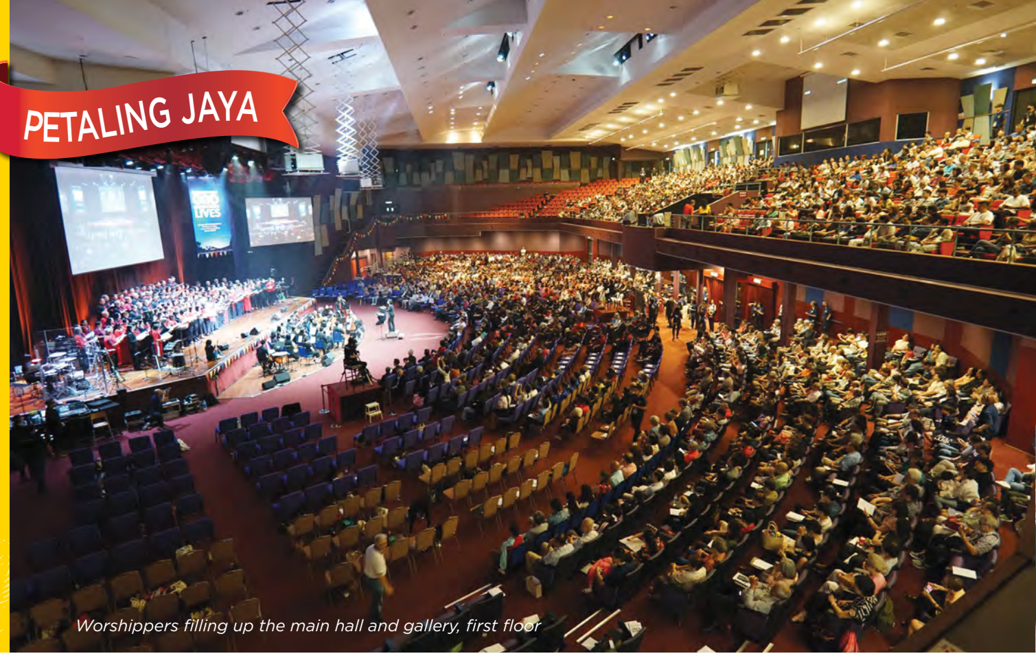
Worshippers filling up the main hall and gallery, first floor