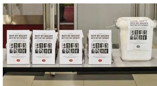
Distribution of the book, Not by Might....