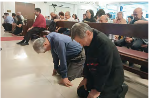
A time of commitment and renewal