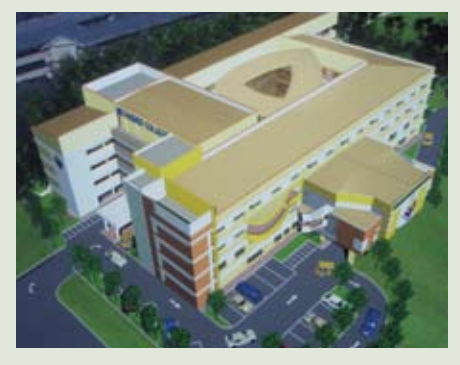
Proposed new building for the College.

separately administered from secondary education, Methodist College became two entities. In 2001 the secondary school was renamed Wesley Methodist School. This relocation, separation and renaming is often the source of some confusion today when MCKL is thought to be in Sentul and confused with Wesley Methodist School.