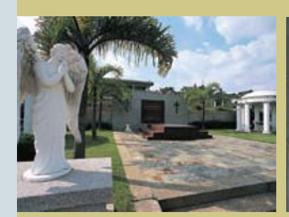
Special Design Burial Plot 特别设计墓地