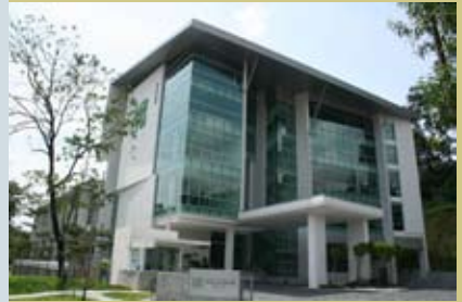
Xiao En Centre, Jalan Kuari, Cheras 孝恩館,吉隆坡蕉赖

There is peace of mind in being able to fulfill your final act of filial piety and assurance knowing that every detail will be taken care of conscientiously. There is dignity in a meaningful ritual well planned and well performed. A Xiao En Bereavement Care Package ensures that the warm memories of your departed loved one will endure for generations to come.