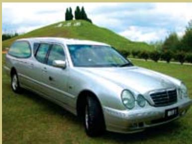
Imported Luxury Hearse 进口豪华灵车