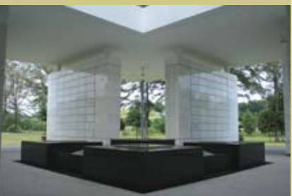
Open-Air Columbarium 开放式骨灰阁