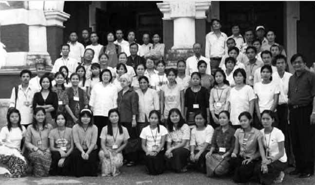
Participants of the Grief Therapy Workshop