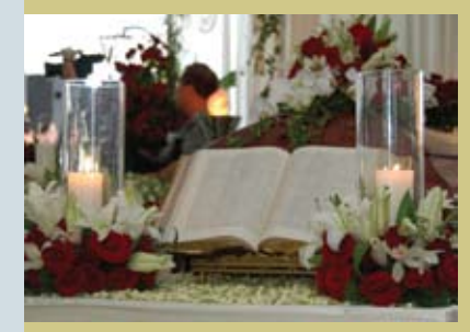
Professional Arrangements 专业策划

One of Malaysia's most beautiful memorial park, Nilai Memorial Park is situated just 30 minutes away from Kuala Lumpur. Surrounded by lush natural greenery, the Park successfully combines the best of oriental traditions and architecture with western planning and design. Set amidst all this is a series of tastefully designed and crafted memorials and niche columbariums, which not only provide a serene final resting place for our departed loved ones but also for others to pay their respects.