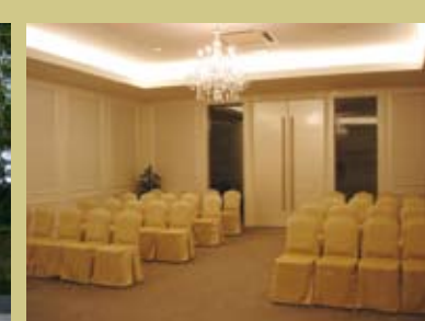
Multi Function Halls 多元用途礼堂