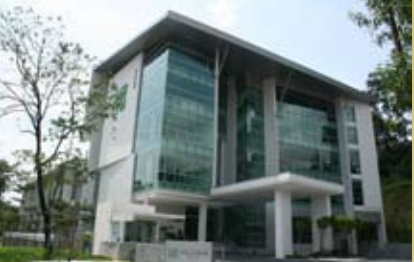
Xiao En Centre, Jalan Kuari, Cheras 孝恩舘,吉隆坡蕉赖