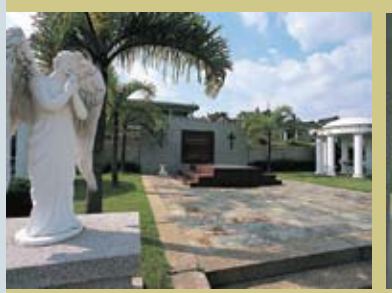
Special Design Burial Plot 特别设计墓地