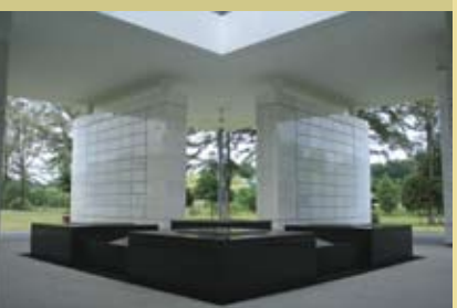
Open-Air Columbarium 开放式骨灰阁