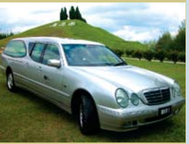
Imported Luxury Hearse 进口豪华灵车