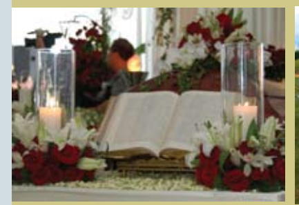
Professional Arrangements 专业策划

One of Malaysia's most beautiful memorial park, Nilai Memorial Park is situated just 30 minutes away from Kuala Lumpur. Surrounded by lush natural greenery, the Park successfully combines the best of oriental traditions and architecture with western planning and design. Set amidst all this is a series of tastefully designed and crafted memorials and niche columbariums, which not only provide a serene final resting place for our departed loved ones but also for others to pay their respects.