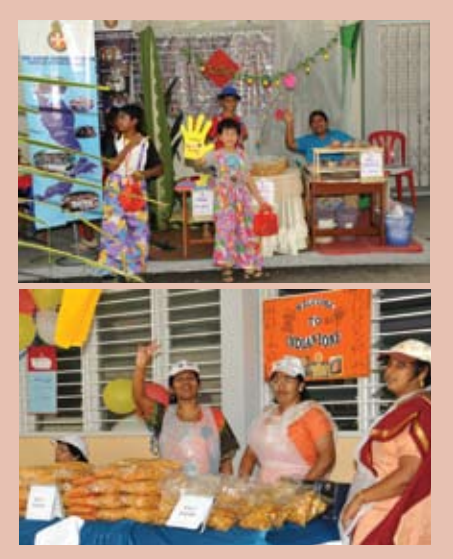
Colourful food stalls

The occasion was honoured by the presence of both the Deputy Minister for Federal Territories, YB Datuk M. Saravannan, and the Member of Parliament for Batu, YB Tian Chua. It is hoped that the church will truly be a light and oasis for the surrounding community of Sentul.