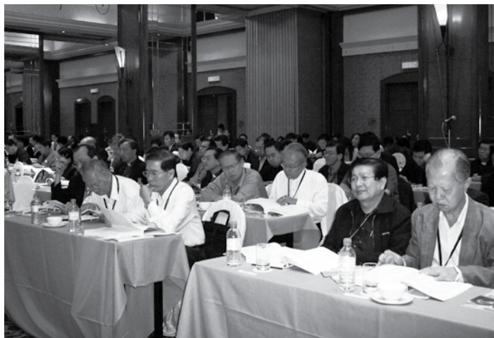
Conference in session

华勇会督宣布第卅三届年议会圆满结束并为会众祝福后，马六甲堂招待全体代表午餐，庆祝马六甲堂设教110周年。