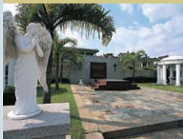
Special Design Burial Plot 特别设计墓地