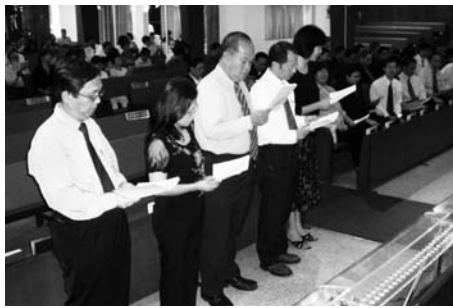
Recognition of new Local Preachers.