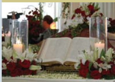
Professional Arrangements 专业策划

One of Malaysia's most beautiful memorial park, Nilai Memorial Park is situated just 30 minutes away from Kuala Lumpur. Surrounded by lush natural greenery, the Park successfully combines the best of oriental traditions and architecture with western planning and design. Set amidst all this is a series of tastefully designed and crafted memorials and niche columbariums, which not only provide a serene final resting place for our departed loved ones but also for others to pay their respects.