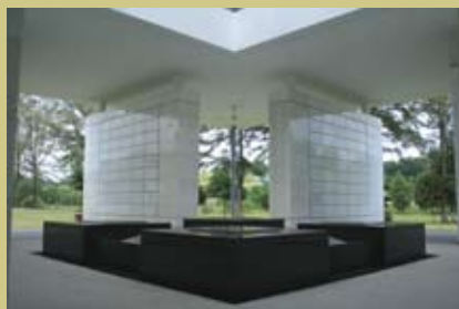
Open-Air Columbarium 开放式骨灰阁