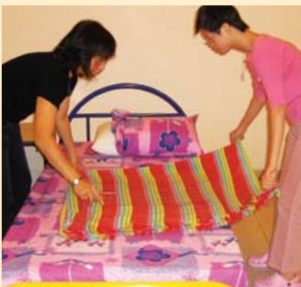
Bed making is part of the ECC curriculum