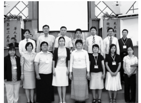
New co-workers joining the Conference.