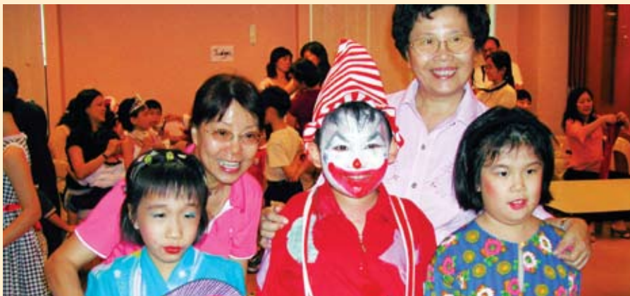
Volunteers help out with classes and events like the Annual Party