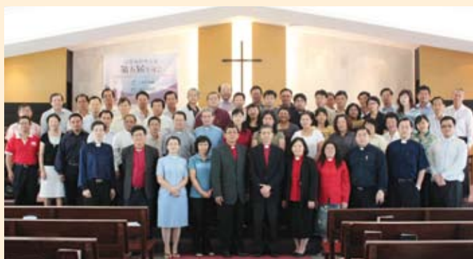
Delegates to the Conference