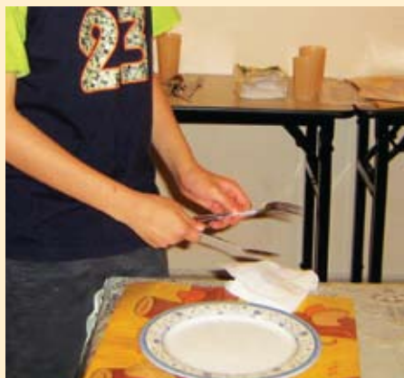
A lesson in self-help skills: table setting