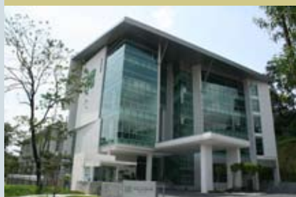
Xiao En Centre, Jalan Kuari, Cheras 孝恩館，吉隆坡蕉賴

There is peace of mind in being able to fulfill your final act of filial piety and assurance knowing that every detail will be taken care of conscientiously. There is dignity in a meaningful ritual well planned and well performed. A Xiao En Bereavement Care Package ensures that the warm memories of your departed loved one will endure for generations to come.