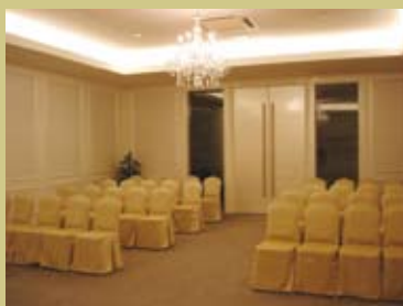
Multi Function Halls 多元用途礼堂