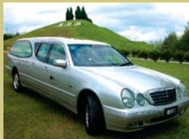
Imported Luxury Hearse 进口豪华灵车