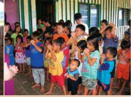
Children always ready to respond.

1. We need to respond to the Great Commission in Matt 28:19-20, "Therefore go and make disciples of all nations, baptising them in the name of the Father and of the Son and of the Holy Spirit, and teaching them to obey everything I have commanded