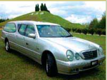
Imported Luxury Hearse 进口豪华灵车