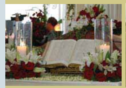
Professional Arrangements 专业策划

One of Malaysia's most beautiful memorial park, Nilai Memorial Park is situated just 30 minutes away from Kuala Lumpur. Surrounded by lush natural greenery, the Park successfully combines the best of oriental traditions and architecture with western planning and design. Set amidst all this is a series of tastefully designed and crafted memorials and niche columbariums, which not only provide a serene final resting place for our departed loved ones but also for others to pay their respects.