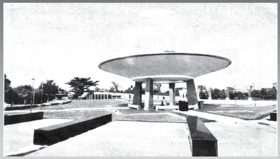
The Funnel at the Hoover memorial: Signifies God beststowing his grace on Sibu.

If ever there was a town in Malaysia that can claim to be founded by Christians and contributed greatly to its early development that town is Sibu in Sarawak.