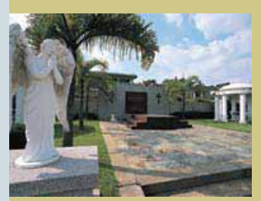
Special Design Burial Plot 特别设计墓地