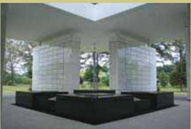
Open-Air Columbarium 开放式骨灰阁