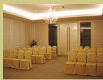
Multi Function Halls 多元用途礼堂