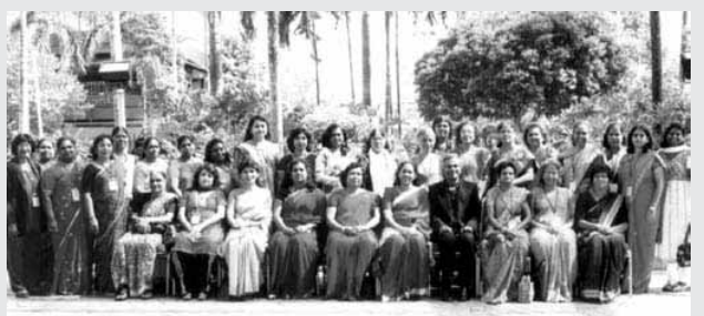
34th TAC – METHODIST WOMEN CONFERENCE August 22-24, 2009