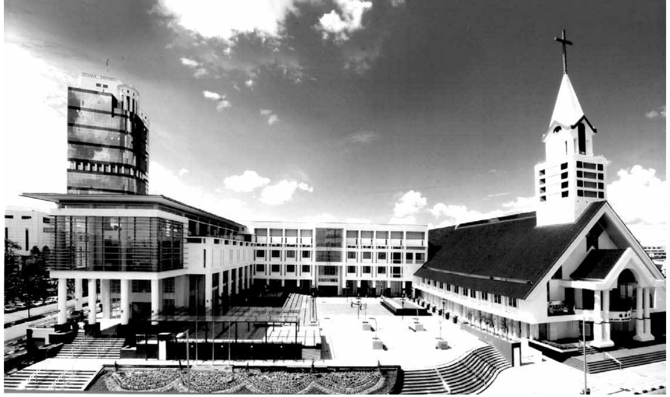
The Hoover Project with the square in the centre, next to Masland Methodist Church.