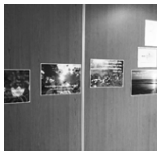
Station 3: The Holy of Holies: Into the Presence of God

The presence of darkness in Malaysia is strong. A huge tidal wave of influence is underway in seven spheres of our society: (1) family, (2) social inequality, (3) education, (4) social problems, (5) religious oppression, (6) national governance, and (7) social media. Yet, many churches are too complacent. Some are blinded to the presence of 'wolves' and their avid activities in our midst. Others are too busy investing in non-essential-cum-temporary materials. What about you? What do you see/read/hear? What do you sense God is saying to you about the on-going events, concerns, people, etc.? What does the Lord impress upon you to pray?