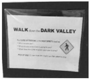
Station 2: The Fall of Humanity: Malaysia Today