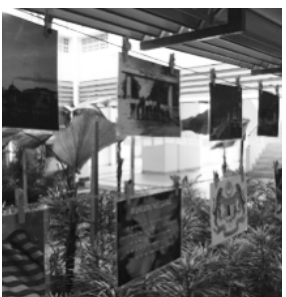
"O let us give thanks to the LORD, for he is good; His steadfast love endures forever!" (Psalm 118:1)