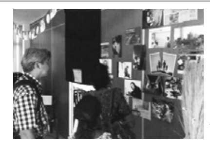
"The intention of man's heart is evil from his youth" (Genesis 8:21b)

The presence of darkness in Malaysia is strong. A huge tidal wave of influence is underway in seven spheres of our society: (1) family, (2) social inequality, (3) education, (4) social problems, (5) religious oppression, (6) national governance, and (7) social media. Yet, many churches are too complacent. Some are blinded to the presence of 'wolves' and their avid activities in our midst. Others are too busy investing in non-essential-cum-temporary materials. What about you? What do you see/read/hear? What do you sense God is saying to you about the on-going events, concerns, people, etc.? What does the Lord impress upon you to pray?