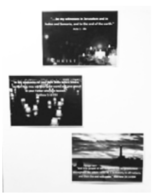
Station 4: Salvation Belongs to God: Out into the World

Would you unite your heart and soul with others to plead for God's mercy over this land? Would you remain faithful till the end? Or would you deny Christ? Commit to God ALL concerns/ events/people . . . that He has impressed upon you during your walk at the 'dark alley' (referring to Station 2). Cry out to Him! As you leave this space, take heart that our God reigns! Malaysia is not condemned and all the peoples will see the glory of our Risen God (Psalm 97:6). For God's throne is established from of old, and He is everlasting (Psalm 93:2). His Holiness and Sovereign Rule hovers above the surging waves of Is* in Malaysia. Let us worship Him (Psalm 97:12).