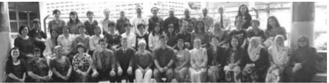
At Methodist College Kuala Lumpur