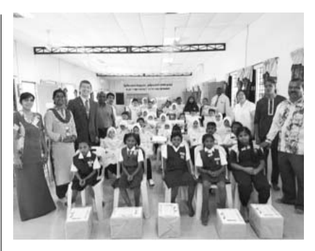
At SJK(T) Methodist, Malim Nawar, Perak of work and witness.

The MEF therefore invites you to join in the exciting and wholly altruistic venture in creating and making even more possible equal opportunities through education for the benefit of youths and adults now and in the future. By supporting the MEF you are making an important contribution to the task of nation building to which the MEF is dedicated. The Board of Trustees asks for your prayers and support in this area