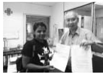
One of the recipients collecting the scholarship cheque

Over the last 32 years the MEF has given out about RM3.4Mil of scholarships to poor and needy students for them to study at institutions of higher learning in Malaysia. The number of applicants for tertiary financial aid is increasing every year. This year the number doubled up to 101 applicants out of which 69 were given scholarships.